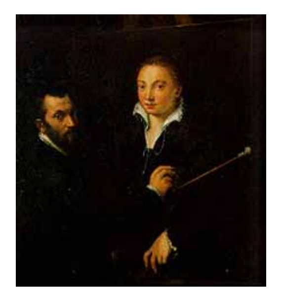
Figure 6. Sofonisba Anguissola. Bernardino Campi Painting Sofonisba Anguissola . Late 1550's. Siena, Pinacoteca

The painting is an example of what Vasari called a "breathing likeness." There is a dark void from which two figures appear, modeled in warm light. They seem caught in a moment that seems intensified by their penetrating gazes at the viewer. This serves to draw us into their world psychologically. According to Garrard, the presence of Campi doubly distances the unseen Anguissola (the artist) from the painted Anguissola (the model) within the fictive realm because he is depicted as being more real than she is within the portrait. <sup>42</sup> There is an active and a passive role played out between the two depicted characters: Campi paints, she is painted. This is exemplified by the placement of their hands: his are working and hers are at rest. Garrard examines the relationships within the painting: