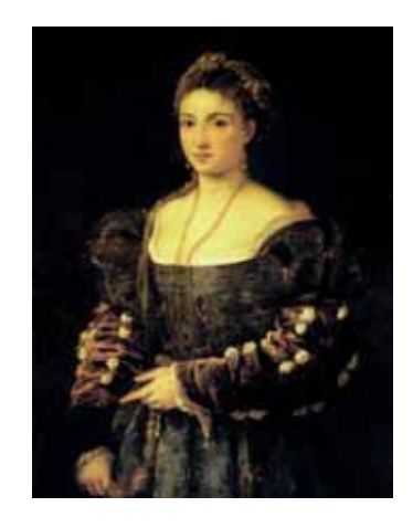
Figure 4. Titian. La Bella . Ca. 1636 Florence, Palazzo Pitti

In order to appear more intellectual, women broadened their brows by shaving their hair in front and piling it in the back. Other European courts copied the elaborate fashions of the Italian court. Many Renaissance female portraits have this look. If the women in these portraits all look similar to us it is because they wanted to be remembered as embodying this ideal.<sup>28</sup> Foremost of these portrait types is Titian's la Bella ( Figure 4 ).